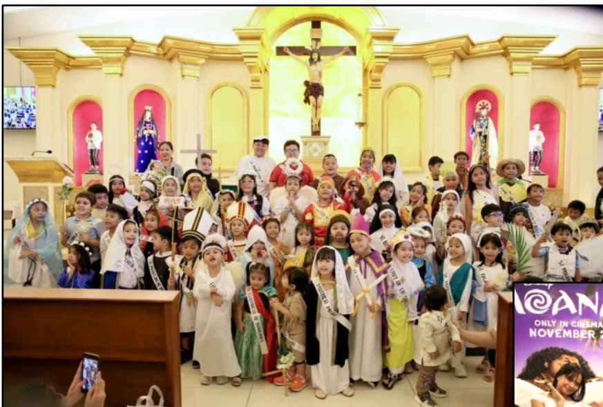
Awesome Kids Youth Walk on All Saints' Day with kids from Sta. Rita Parish