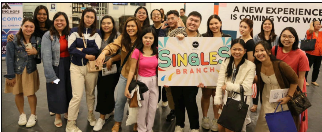
Singles Branch Engagement